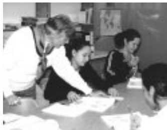
Opening Word is a literacy program designed to assist immigrant women.