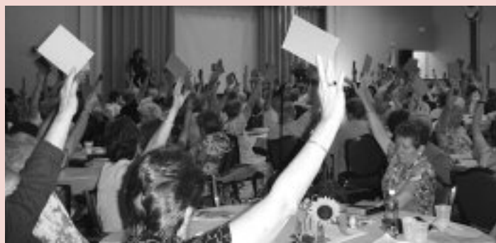
The future path of the Congregation is determined by a democratic vote of the Sisters (pictured above) at Chapter 2006.

Empowered by 800 years of Dominican life, we pray with Dominic and Catherine to be signs of joy and hope in 2006 and beyond. Amen.