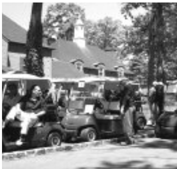
Golfers take to their carts at the second annual Dominican Golf Classic in May.