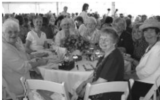
Dominican Commercial High School alumni enjoy the Beauty of the Spirit Luncheon in June.

This past Spring, the 2006 fundraising calendar began with two popular outdoor events. Great weather and enthusiastic participation contributed to the success of both.