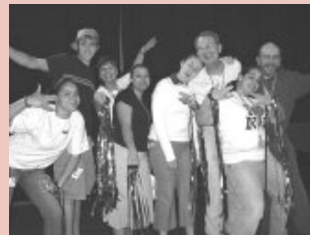
"Preaching In Action" participants enjoyed expressing their spirituality via song and dance.

During the week students used their creativity and musical talents to prepare the prayer service and liturgies that are a vital part of the conference schedule. This was a powerful experience for those who do not ordinarily have this opportunity either in their parishes or colleges. As a result, many expressed the desire to become members of the planning committee for their campus prayer services and liturgies. At the closing liturgy each student was encouraged to fulfill her/his own Christian mission of preaching the Good News to all she/he comes in contact with. The wonderful memories of this week will surely last for a long time.