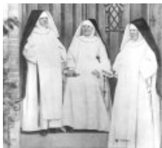
Three of the Sisters who came to Brooklyn from Germany in 1853.

Throughout our 153 year history, the Dominican Sisters of Amityville have always been attentive to the shifting waves of immigration, and have attempted to respond appropriately. Our roots, you see, are “immigrant” roots. From our foundation in Most Holy Trinity, our Sisters spread out to neighboring German parishes, including All Saints, St. Leonard’s and St. Nicholas. They also went to Manhattan, staffing Our Lady of Sorrows School (1868 to 1976).