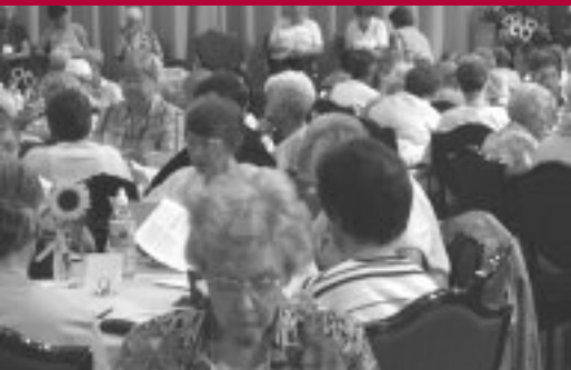
Sisters plan for the future at Chapter 2006.